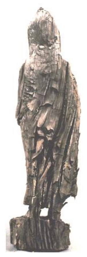
Figure 1. Wood statue of Buddha from fifth century found in Go Thap, Vietnam

In comparison with these two statues, the statue found in the Plain of Reeds in Binh Dinh, Vietnam is well preserved (see Figure 2). It is 1.35 meters tall but is well proportioned; thus, it is reminiscent of the Amaravati, or Nagarjunakonda, style. Early Buddhist statues in Southeast Asia are usually dated to the sixth and seventh centuries, but this statue is assumed to have been made in the early sixth century due to the even bodyline and erect posture with bilateral symmetry. The garment is not clearly visible, but it seems that the right shoulder is bare because the lower drapery appears lopsided. The draperies are hardly visible on the cracked surface, and the hem of the left sleeve comes down to the ankles, which is similar to the Southern Indian style. However, the image has little volume because it was made of wood.