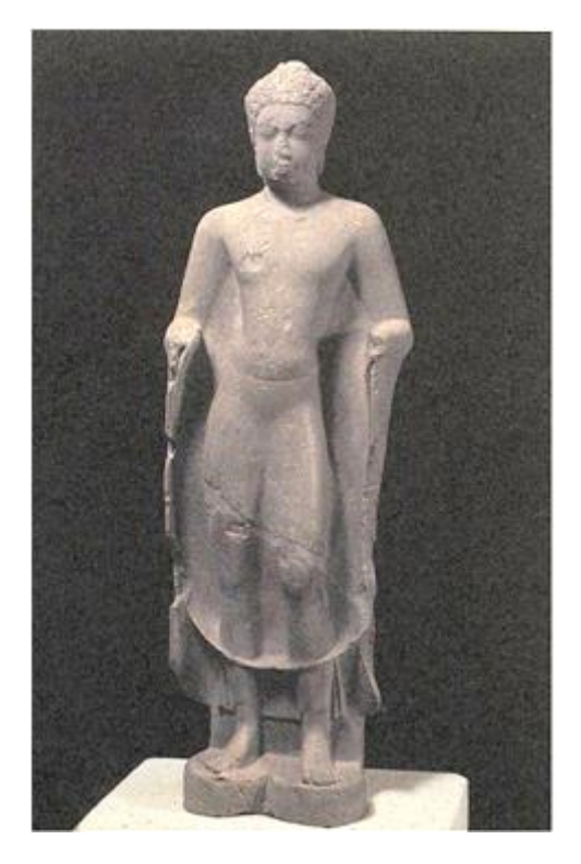
Figure 7. Statue of Buddha from sixth century found at Wat Romlok, Cambodia

Angkor Borei was presumed to be the centre of Funan, where the Sarnath-style Buddha sculptures were found. The area was adjacent to Phnom Da, one of the most important historical sites in Cambodia. The Buddha image found in Wat Romlok in Ta Keo, Angkor Borei, is the best example (see Figure 7) (Jessup 2004, 34–35). This well-preserved statue is superior to the Wat Wiang Sa statue in sculpturing, and its surface is finely smoothed like the Sarnath sculpture. It has a well-proportioned figure despite a height of approximately one meter. The thin and long limbs, the well-balanced bodyline, the tribhanga with a slightly bent left leg, and the curvy belt finishing reflect the Sarnath-style. In particular, the wellproportioned figure, slinky garment, and natural bodyline are very similar to Sarnath sculptures made in the late fifth century. However, there are a few differences. Whereas Sarnath sculptures have round, solid faces, the Wat Romlok statue has a narrower face, and no collar line is depicted in the garment. This means that the Buddha sculpture, originating from Sarnath, had been changed in accordance with the aesthetic sensibilities of Funan. The narrower face was likely more preferred in Funan than in India considering the statues found in Cambodia and Angkor Borei.