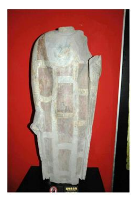
Figure 9. Statue of Buddha from sixth century found in Zhucheng, Shandong, China