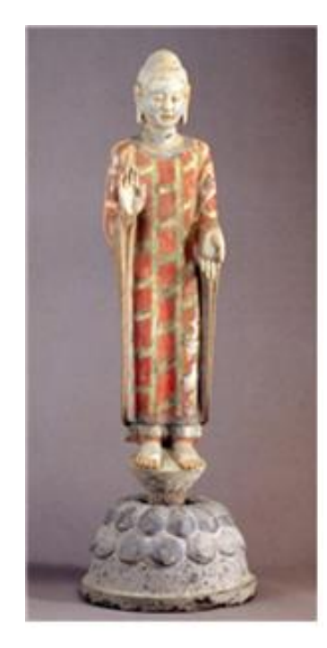
Figure 8. Statue of Buddha from sixth century found in Qingzhou, Shandong, China

dynasty. These statues are slender in physical volume and show different proportions compared to statues from India and Southeast Asia. Nevertheless, because no drapery is expressed on the garments and the garments are treated to better reveal the physical outlines, the Buddha images found in Zhucheng are very similar in style to those in India and Southeast Asia.