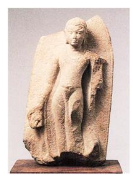
Figure 4. Sandstone statue of Buddha from fifth century found at Wat Wiang Sa, Thailand