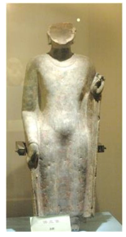
Figure 11. Statue of Buddha from sixth century found in Bo-Xing, Shandong, China

In 1976 and 1983, Buddhist sculptures made of various materials were found at the site of the Longhua Temple located in Bo-Xing and Chongde in Shandong. The stone statues were primarily made between the Eastern Wei and Northern Qi dynasties (Li 1984). The thin, bare-right-shoulder garment clinging to the body reflects the style created in Southern India or Southeast Asia (Kim 2004, 16). Some of the standing Buddha images found in Bo-Xing also reflect the Sarnathstyle (see Figure 11). The narrow shoulders and insufficient volume differ somewhat from Sarnath-style sculptures, but the roundish shoulders and legs and delicately touched arms were never seen before in Chinese sculptures. The understated volume is reminiscent of the standing Buddha image found at the site of Temple Wha-yan (see Figure 6). In addition, similar to the statues found in Chengzhou or Zhucheng, the garment is painted, not sculpted.