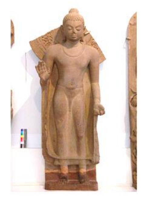
Figure 5. Sandstone statue of Buddha from 473 CE found in Sarnath, India

The Spread of Sarnath-Style in Buddha Images