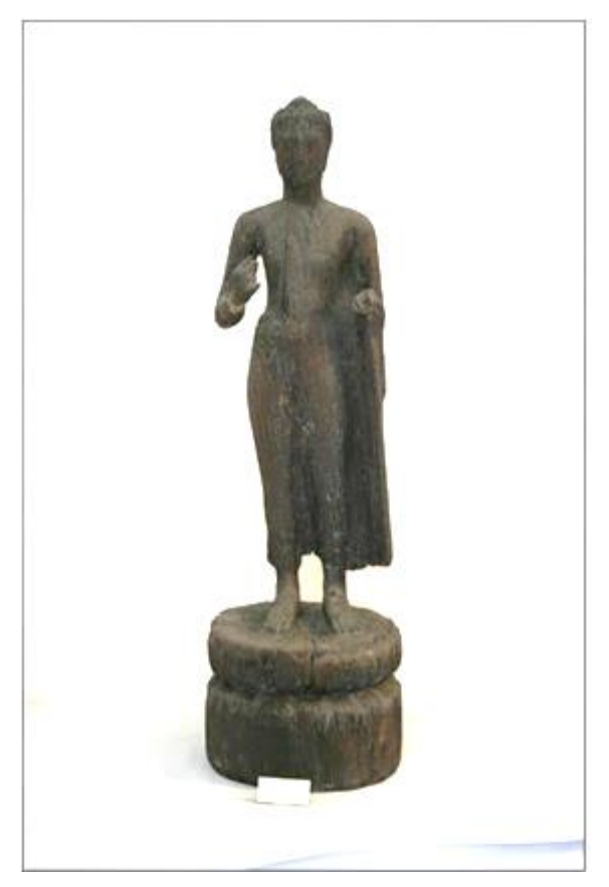
Figure 2. Wood statue of Buddha from fifth century found in Binh Dinh, Vietnam

Buddhist statues made in Southeast Asia are usually characterised by a bare right shoulder. This feature is known to have originated in Sri Lanka and Southern India. However, not all Buddhist statues produced in Southeast Asia have bare right shoulders. Statues with garments covering both shoulders have been found quite often in Southeast Asia. Such images have primarily been found in inland areas and are remarkably similar to Indian statues. Thus, it is likely that the style was first introduced into inland areas, revealing the first stage of Buddhist statues made in Southeast Asia. When these sculptures were produced, Funan was part of the city-state federation. Although the statues belong to Funan in a broad sense, they were not found in specific regions. Buddhist statues have been found sporadically in the southland of Vietnam, the Malay Peninsula that falls under the territory of Thailand, and Angkor Borei in Cambodia. These areas were likely to have been part of the territory of Funan in its prime. After Zhenla (the former name of Cambodia) encroached on the territory of Funan in the mid-sixth century, large and small countries rose and fell there (Kang 2009).