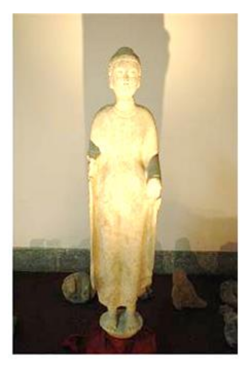
Figure 10. Statue of Buddha from sixth century found in Linqu, Shandong, China