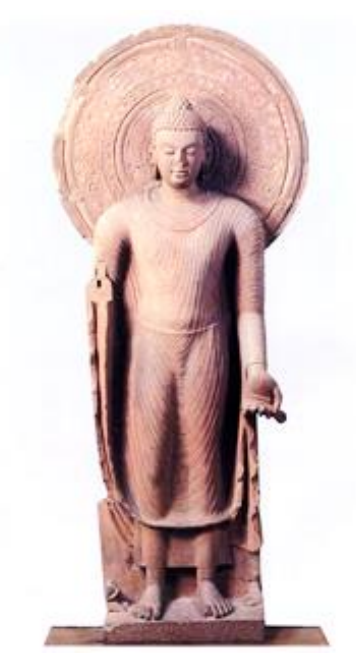
Figure 3. Sandstone statue of Buddha from fifth century found in Mathura, India

Southeast Asia, the locals must have acquired the skills to make small-sized Buddhist statues. The above-mentioned wooden statues support this assertion.